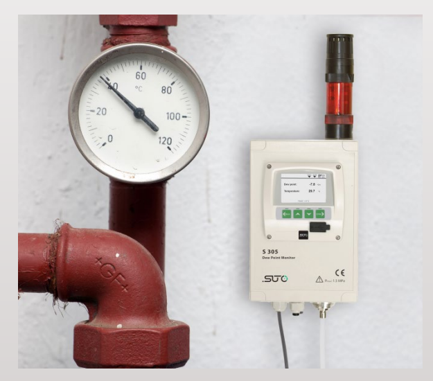
optional alarm unit mounted on the housing